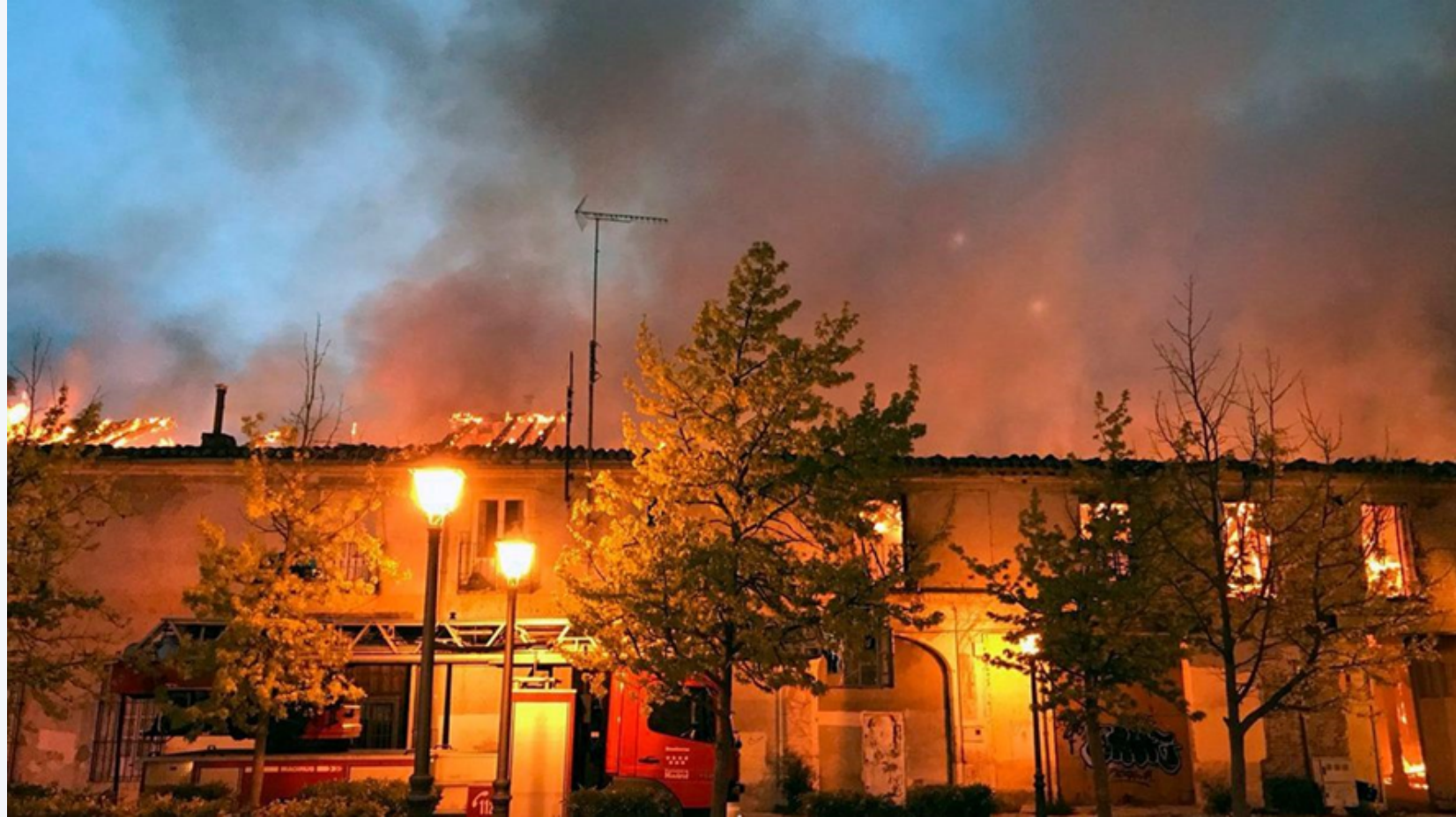
Palacio de Osuna, burnt down in 2018