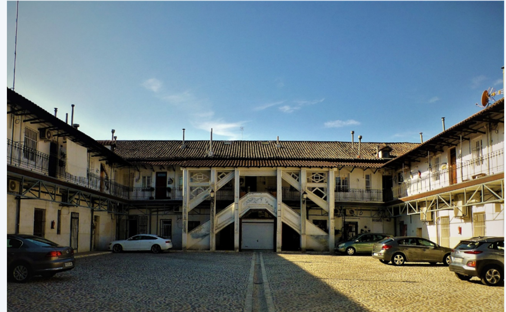
Corrala “El Parador del Rey” after refurbishment

Aid programme of rehabilitation plans in residential buildings, 2023