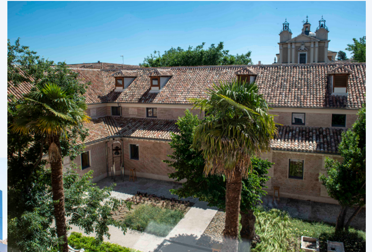
Hospital de San Carlos, new facilities of Rey Juan Carlos University