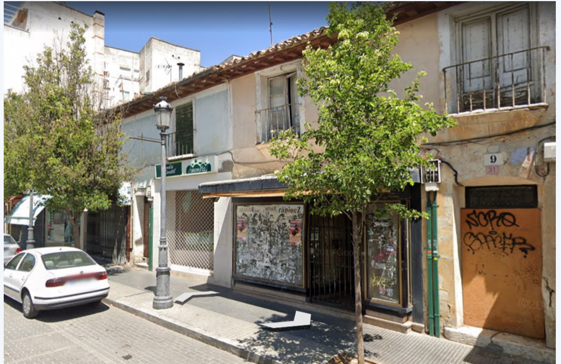
Stuart street, one of the main avenues in Aranjuez