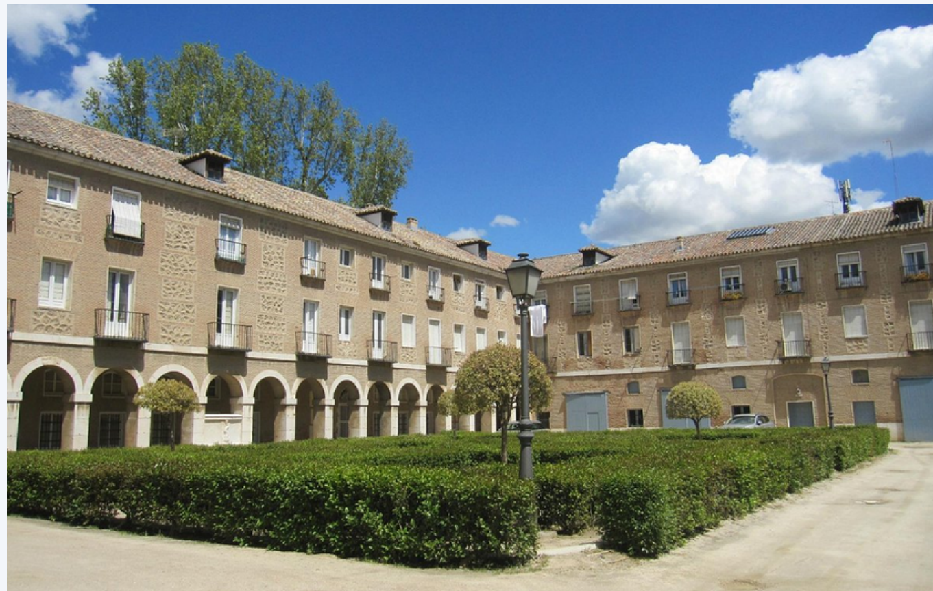
Casa de Infantes